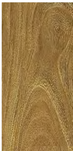
165 Rio de Sol